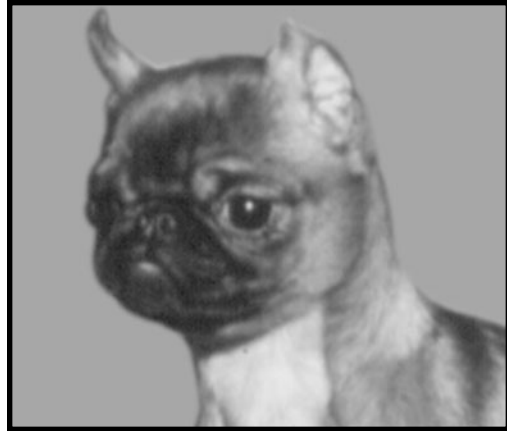
Medium length, gracefully arched neck