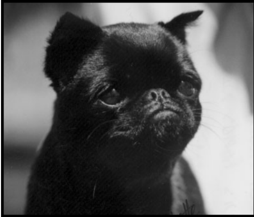
Clean finish to the short upper lip