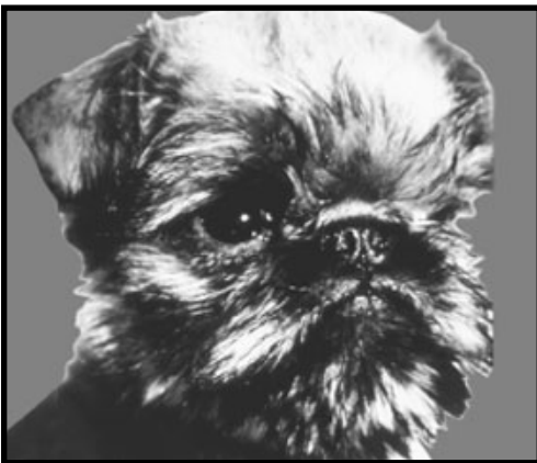
A straight "midline" from the nosepad through the chin will indicate that the mouth is not wry.