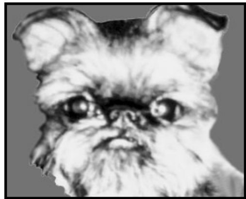
A retained baby canine may cause the upper lip to hang up and give illusion of a wry mouth.